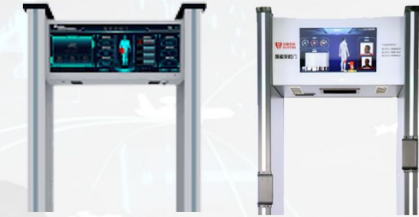
* WALK THROUGH GATES (A.I)