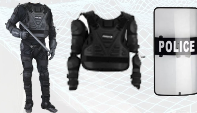
ANTI RIOT SUITS & SHIELD