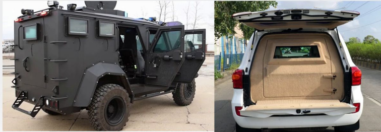
ARMOURED VEHICLES (BULLET PROOF VEHICLES)