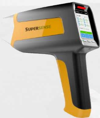
DOSE ALARM SYSTEM