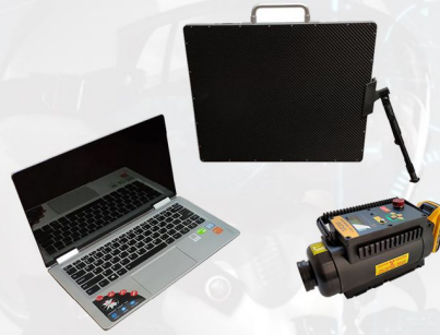
PORTABLE XRAY MACHINE