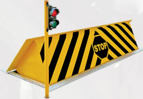
* ROAD BLOCKERS - Surface Blockers & Bollards