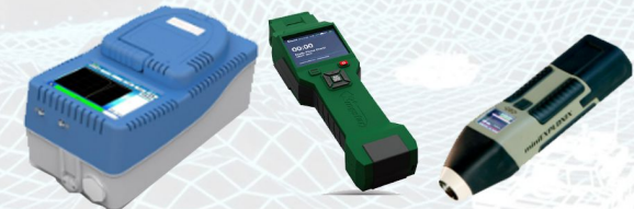
* EXPLOSIVE DETECTORS