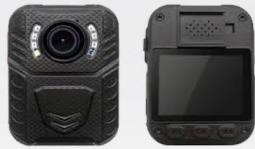
* BODY WORN CAMERAS (With Online Realtime - Location)