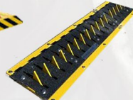
* TYRE KILERS - Road Spikes, Tyre Busters