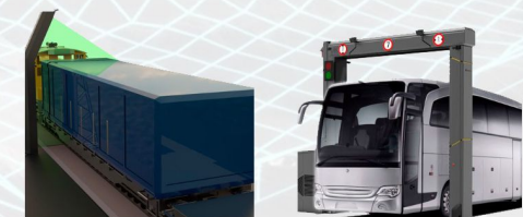
* VEHICLE AND CARGO X-RAY INSPECTION SYSTEM