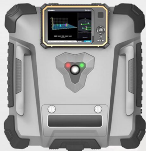
THROUGH WALL RADAR