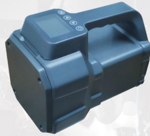
ELECTRONIC LISTENING DEVICE