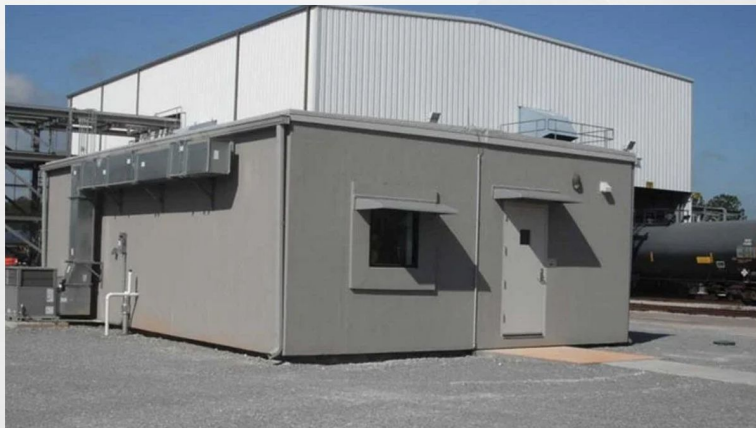
BLAST RESISTANT MODULAR BUILDINGS