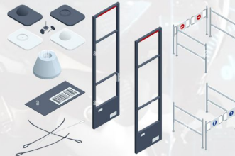
* EAS GATES - ANTI SHOP LIFTING