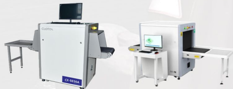
* BAGGAGE SCANNERS