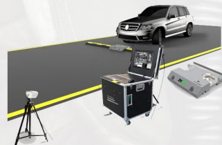
* UNDER VEHICLE INSPECTION SYSTEM