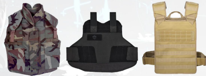
BULLET PROOF JACKETS