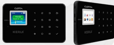
* HOME ALARM SYSTEM