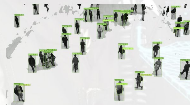
* A.I PEOPLE TRACING & TRACKING